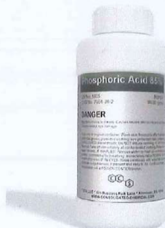
Phosphoric Acid 85% Food Grade