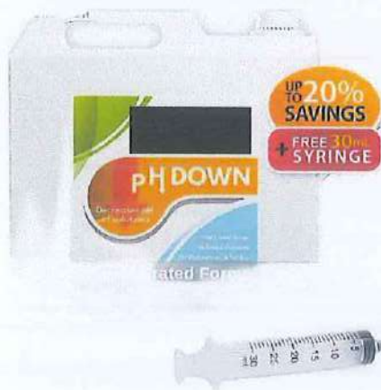
pH Down – pH adjuster concentrate