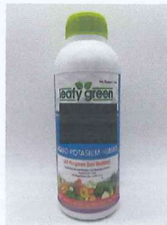
Plant Food – Leafy Greens