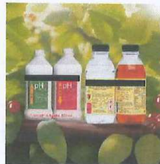
Fruit bearing Nutrient Solution Set A&B