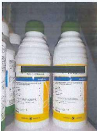
Lambda – cyhalothrin Insecticide