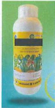
300EC Chlorpyrifos (Gold)