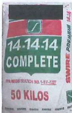
Professional Fertilizer 14-14-14