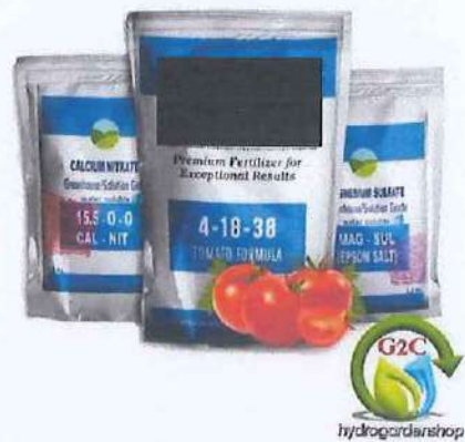
Tomato Formula Set